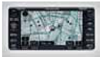
SATELLITE NAVIGATION (3) AUDIO SYSTEM INCLUDES 4 IN-DASH CD CHANGER WITH BLUETOOTH TM(4) HANDSFREE COMMUNICATIONS & (OPTIONAL) REAR VIEW CAMERA (1) COMPATIBILITY GX models only.