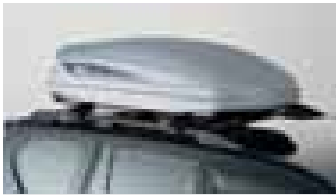
ROOF PODS - AVAILABLE IN ATLANTIS (200 OR 600) OR PACIFIC (200) (Pacific shown)