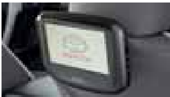
REAR SEAT ENTERTAINMENT SYSTEM GX, GXL & VX models only.