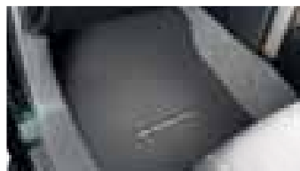
FLOOR MATS - RUBBER OR CARPET (Carpet shown)