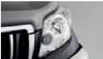
BONNET PROTECTOR & HEADLAMP COVERS (sold separately)