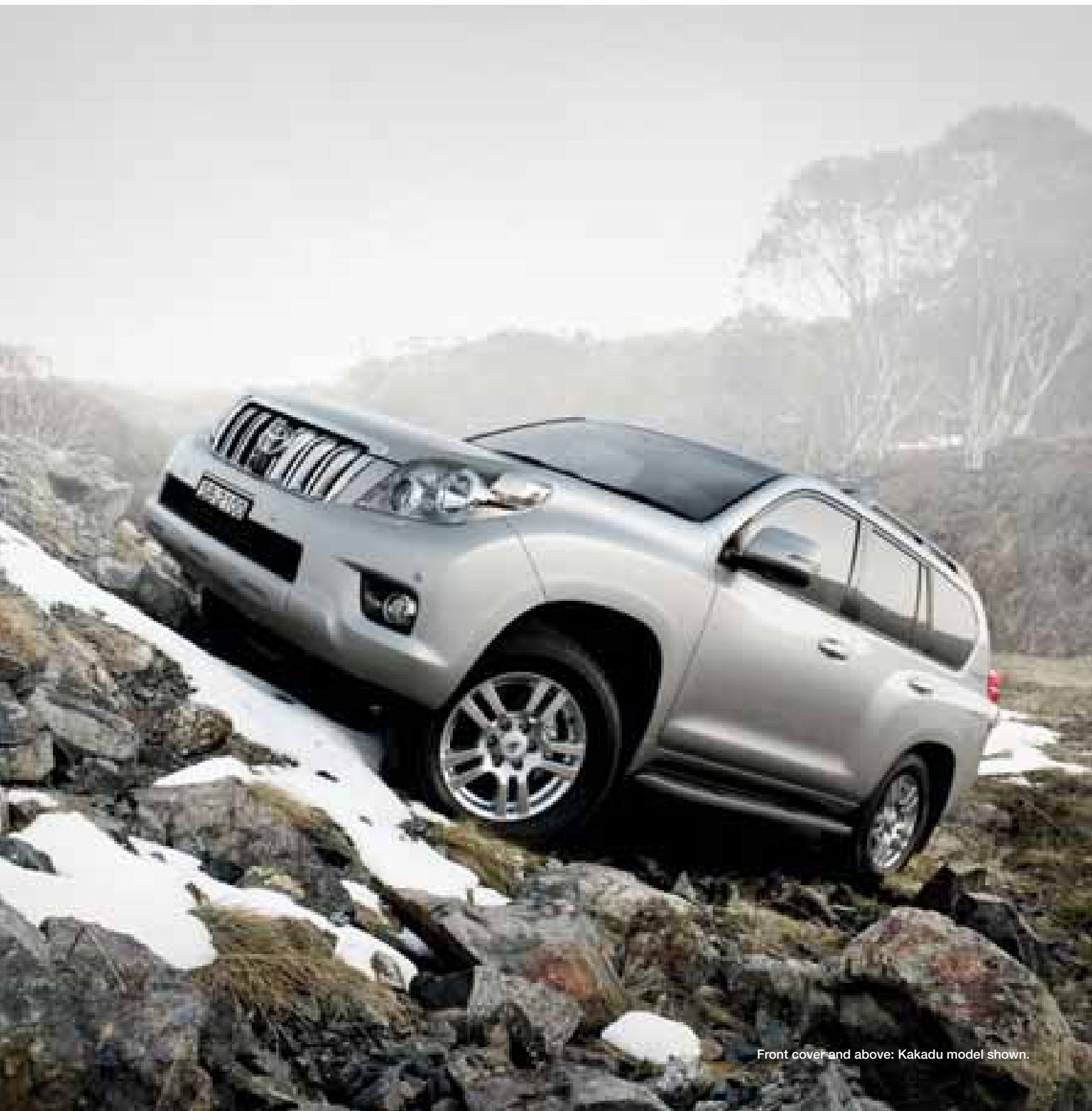
Front cover and above: Kakadu model shown.

This is the Prado that can take you almost anywhere in style and make every journey a destination in itself.