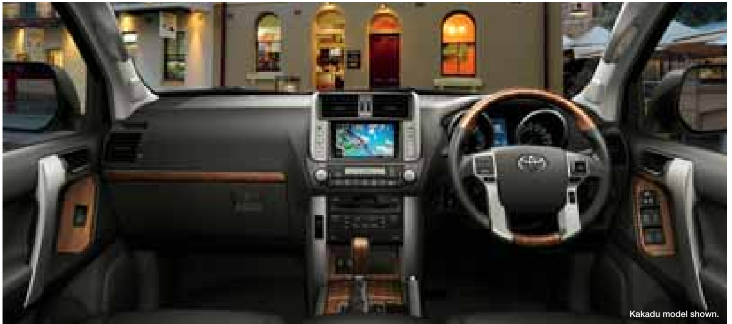
Kakadu model shown.