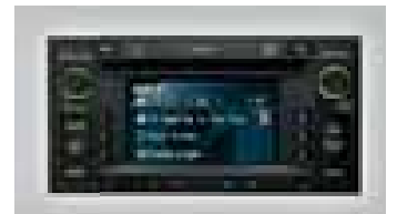
DISPLAY AUDIO SYSTEM INCLUDES 6 IN-DASH MP3/CD CHANGER & RADIO WITH ADVANCED BLUETOOTH TM(4) FEATURING HANDSFREE COMMUNICATIONS & STEREO AUDIO STREAMING (5) , USB/AUXILIARY AUDIO INPUT/IPOD (6) & (OPTIONAL) REAR VIEW CAMERA (1) COMPATIBILITY GX models only.