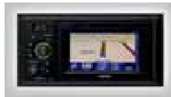
FOLLOWME SOUND & NAVIGATION (3) SYSTEM INCLUDES BLUETOOTH TM(4) HANDSFREE COMMUNICATIONS, VIDEO, USB, IPOD (6) , MP3 & (OPTIONAL) REAR VIEW CAMERA (1) COMPATIBILITY GX models only.