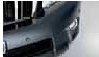
PARKASSIST (1) - AVAILABLE IN CLEARANCE OR REVERSE (Clearance parking sensors shown)