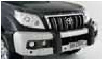
LOW PROFILE ALLOY BAR

This Prado is the most technologically advanced Prado we have ever built, which means it is capable of going places you never before thought were possible. Whether you need something to make your Prado even better suited for the off road, or you want something to add that extra touch of luxury and make your Prado more comfortable on road, we have a Toyota Genuine Accessory to suit every need.