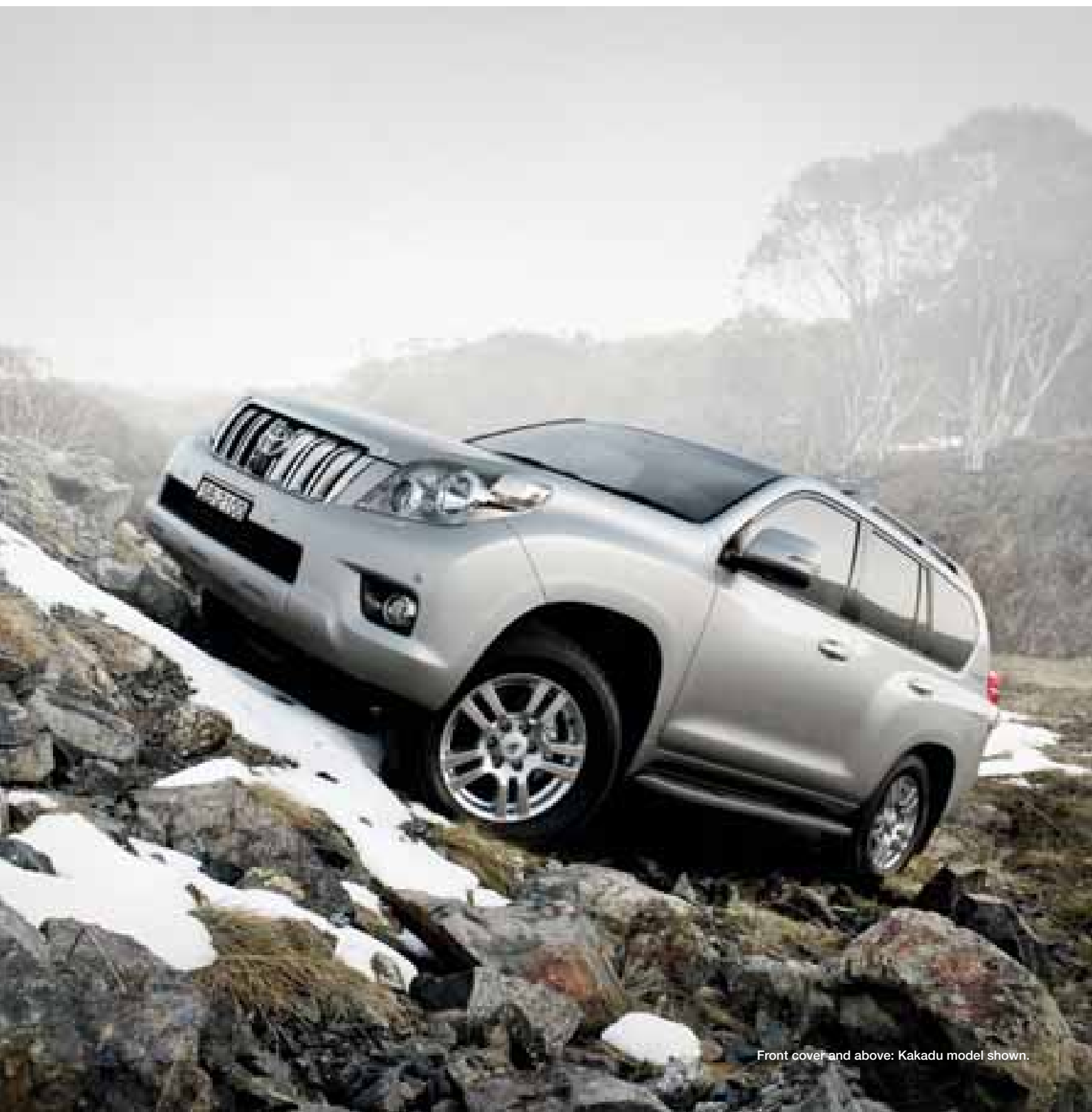
Front cover and above: Kakadu model shown.

This is the Prado that can take you almost anywhere in style and make every journey a destination in itself.