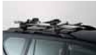
DELUXE SKI & SNOWBOARD CARRIERS (4 OR 6)