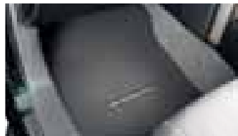
FLOOR MATS - RUBBER OR CARPET (Carpet shown)