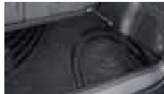
ALL WEATHER RUBBER CARGO MAT GX variant not available until February 2010.