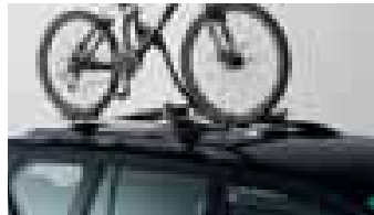
PRO RIDE BICYCLE CARRIER