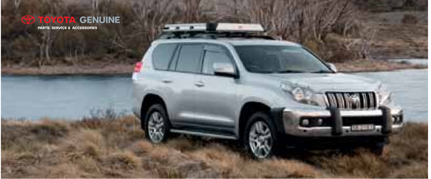
Prado 5 door Kakadu shown in Silver Pearl accessorised with Low Profile Alloy Bar, Headlamp Covers, Bonnet Protector, Front Weathershields, Aero Roof Racks (Roof Rail Type) & Alloy Tray.