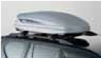
ROOF PODS - AVAILABLE IN ATLANTIS (200 OR 600) OR PACIFIC (200) (Pacific shown)