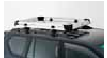
ALLOY ROOF TRAY