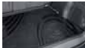
ALL WEATHER RUBBER CARGO MAT GX variant not available until February 2010.