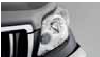
BONNET PROTECTOR & HEADLAMP COVERS (sold separately)