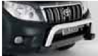
ALLOY NUDGE BAR